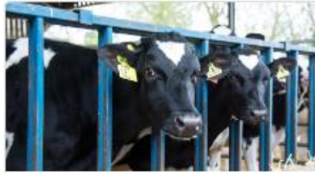
Dairy sector resilience plan

Combinable crops sector resilience plan – NFUonline