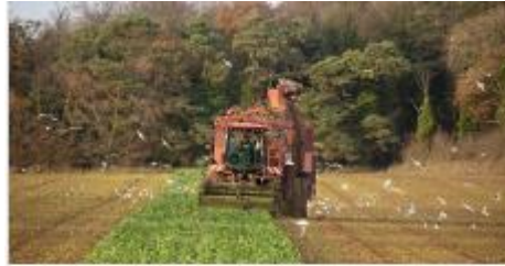
Sugar sector resilience plan

Livestock sector resilience plan – NFUonline