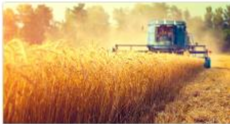
Combinable crops sector resilience plan

Combinable crops sector resilience plan – NFUonline