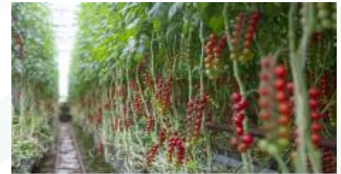
Horticulture and potato sector resilience plan

Dairy sector resilience plan – NFUonline