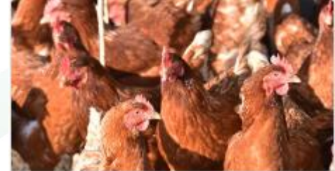
Poultry sector resilience plan

Sugar sector resilience plan – NFUonline