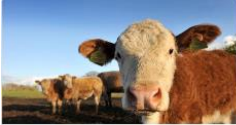
Livestock sector resilience plan

Livestock sector resilience plan – NFUonline