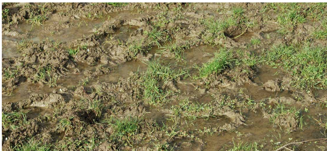
Poaching promotes loss of nitrogen by denitrification and of phosphate by soil erosion

Where the soil is anaerobic (oxygen starved), nitrate can be converted by microorganisms to nitrous oxide, which is a potent greenhouse gas. Poaching, poor drainage or waterlogging can make soil anaerobic and will increase nitrogen loss.