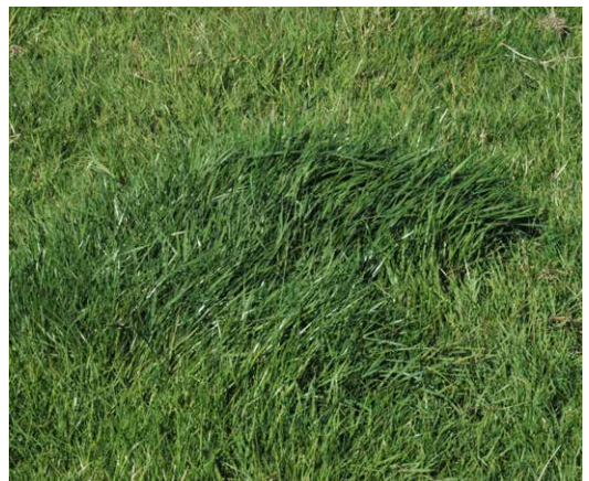
Urine patches cover a larger area and the nutrients are in available forms