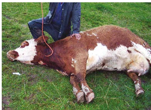
Cow with hypomagnesaemia

Excessive potash in the soil can affect magnesium uptake by grass and increase the risk of staggers (hypomagnesaemia) in cattle. Rapidly growing grass will take up potash quickly and in greater quantity than actually needed, interfering with the uptake of magnesium. Large single applications should be avoided on grazed swards. Little and often is better practice.