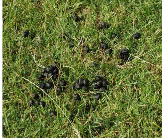
Cattle and sheep dung is distributed unevenly with poor soil contact