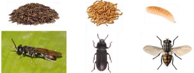
Black soldier fly Hermetia illucens Yellow mealworm Tenebrio molitor Common housefly Musca domestica